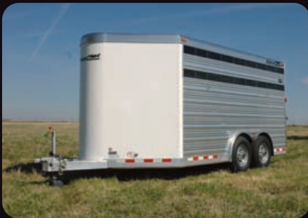
Lonestar Bumper Hitch