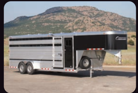
Lonestar w/ Front Tack Room