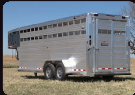
Lonestar Rear View