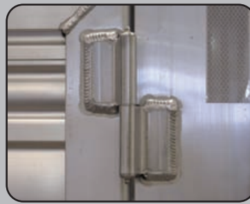
Heavy Duty Hinges with Grease Zerts