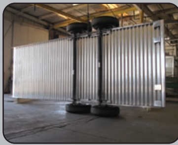
Interlocking Floor on 4" centers