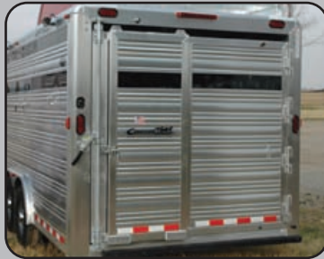
Sliding Rear Gate