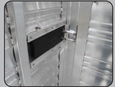
Quiet Flush Mount Slam Latch on Center Gate